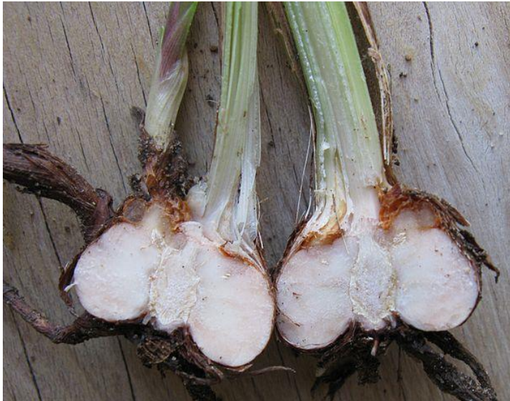
Grasses and roots, like the fleshy corm of this Crocosmia plant native to eastern Africa, helped hominins survive outside of lush forests. They also may have promoted the reduction of canines to serve a greater role in biting and chewing.

To support the dietary hypothesis, we can look to other changes in dentition and diet. Concurrent evolutionary trends included thicker enamel and a more vertical orientation of chewing muscles. 45 This suggests that hominins were eating hard foods such as seeds, grains, and nuts, which are crushed by flat molars. 46 They also ate an increasing amount of fleshy grass-root vegetables after 3.5 MYA. 47 Some species developed smaller mouths and larger molars 48 that would have crowded out large canines; many people today still need wisdom teeth removed. These demands on teeth could have pressured the more efficient use of canines as reduced chewing instruments.